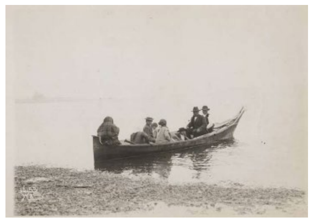
Indians in Canoe, ca 1911

cedar logs. They used their canoes to fish, hunt, visit friends and family, and conduct trade with other tribes. When the first settlers arrived, they found it very helpful that the Native people had canoes and were willing to help them move their families