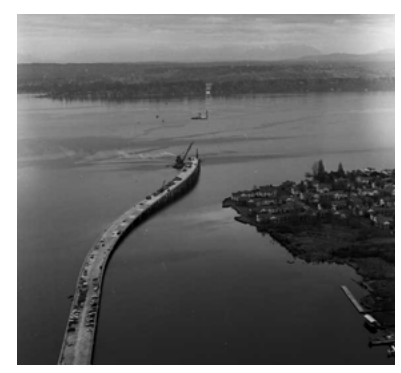
Aerial view of Evergreen Point Floating Bridge, March 1963.

As more people began to use cars and trucks, the need for bridges across the lake grew. Bridges would allow individuals to drive from one side of the lake to the other to reach their homes or businesses much more quickly than taking a ferry or driving around the lake. Bridges allowed industries that were based on the east side of Lake Washington to move their products to the seaport in Seattle more eco-