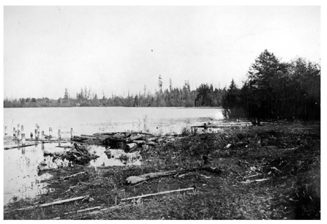
Washington Park from east side of the Montlake Portage, 1903. Photo by Olmsted Brothers. Courtesy Seattle Municipal Archives, Item No. 30538.

ple who have lived here, and how this historic understanding might influence urban-development decisions being made today. Project of the Burke Museum.