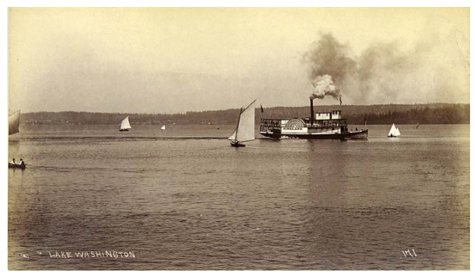
The sidewheeler steamer Kirkland crossing Lake Washington, ca. 1891.

Transportation: the movement of goods or people from one place to another