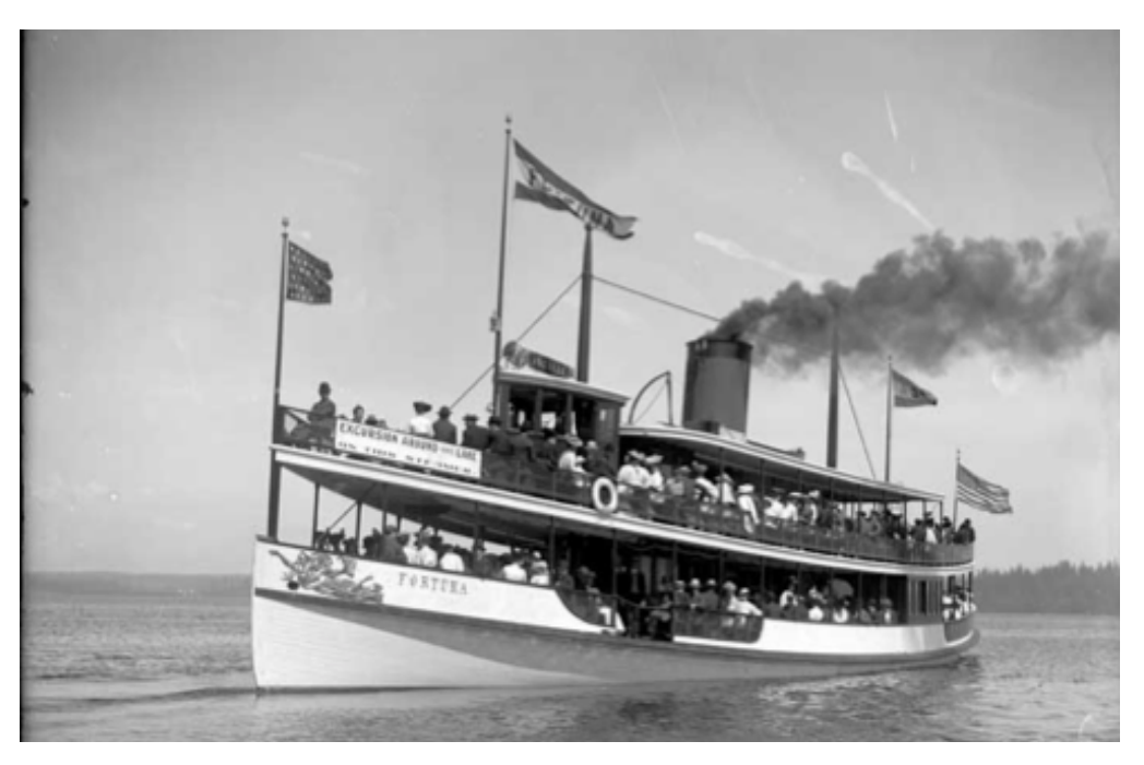
Steamer Fortuna, ca. 1906.